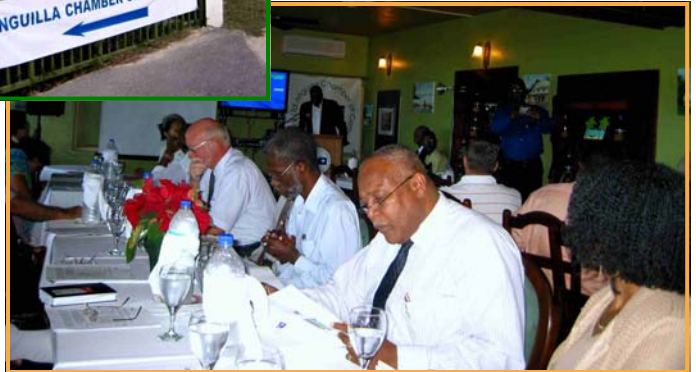
(to be announced). In addition, seven 2006 ACOCI Board directors were also elected from 12 nominees. See p. 2.

continued support (supporting) will be necessary to fund the remaining 20% of the Chamber activities beyond the “maximum 80%” subvention in the anticipated agreement. New bye-laws also established a framework for classified advertising on the updated ACOCI website in the near future