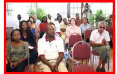
Left: 2005 "Best" business certificate in the NBA board room. Above: 2004 Anguilla Business Survey presentation, Paradise Cove Resort. Below: 2005 presentation, English Rose, The Next Level.

access to a secure, independent site hosted privately by ClieTell Consulting using a web-based survey for total confidentiality —and easy 24/7 convenience to have your say in the survey at: www.anguillachamber.com