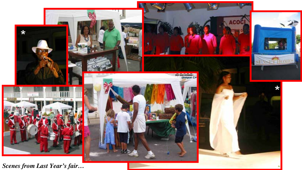
Scenes from Last Year's fair...